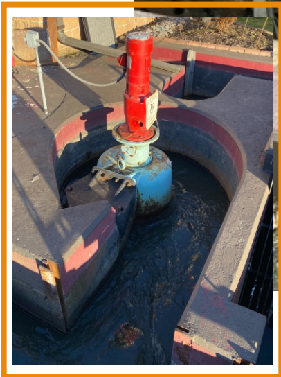
Retrofitting Chicago Pump 25M