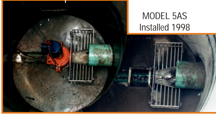
MODEL 5AS Installed 1998