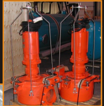
Preparing to Ship (2) Grind Hog TM 10ASX A/C

NIRA Consulting Engineers, Inc. Corapolis, PA