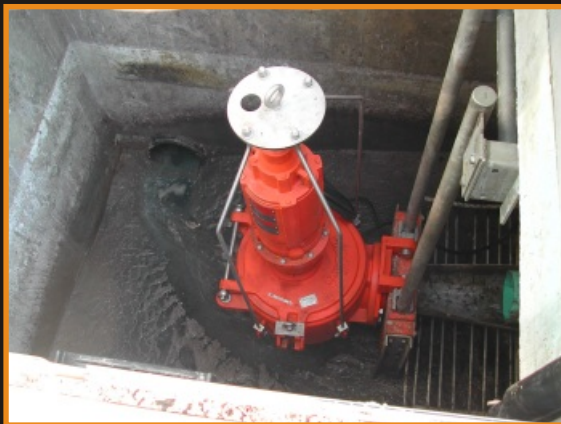
10ASX A/C Installed Heights Pump Station