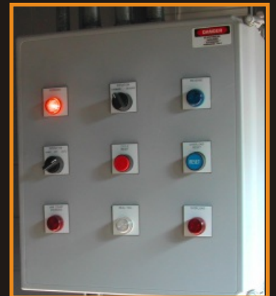
Grind Hog TM Controller