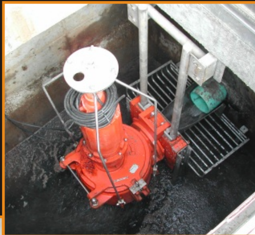
10ASX A/C Installed Wilson Pump Station