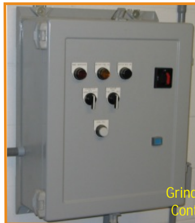
Grind Hog™ Controller