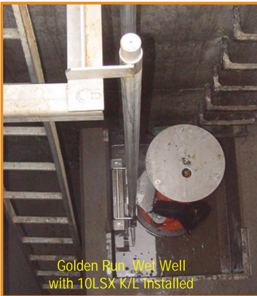
Golden Run Wet Well with 10LSX K/L Installed