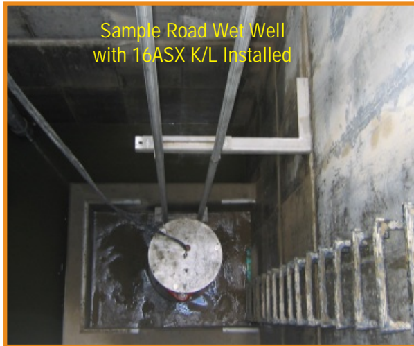
Sample Road Wet Well with 16ASX K/L Installed