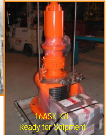
16ASK K/L Ready for Shipment