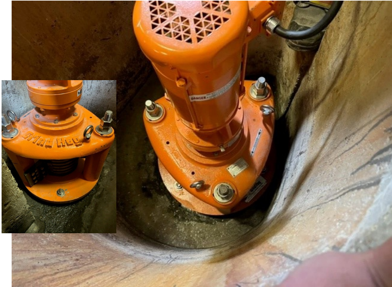
Previous Chicago Pump 10C and Existing Basin