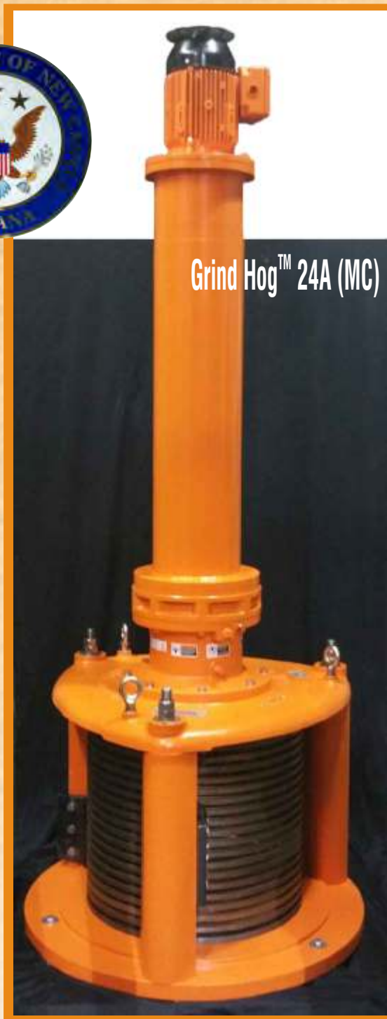
Grind Hog™ 24A (MC)