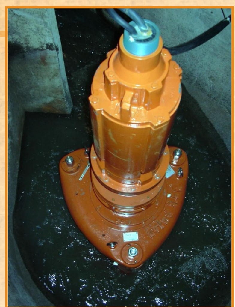
Basin of previously installed Chicago Pump 25M