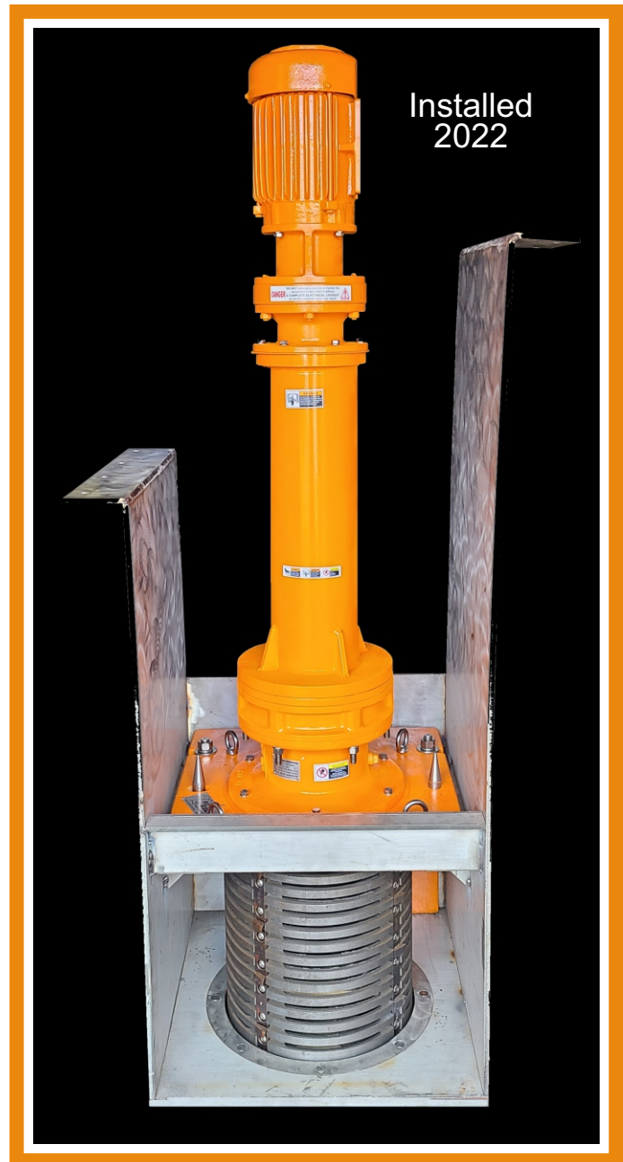
Grind Hog 16A T/S (MC) Motor Column Mount Replaced 16AS T/S